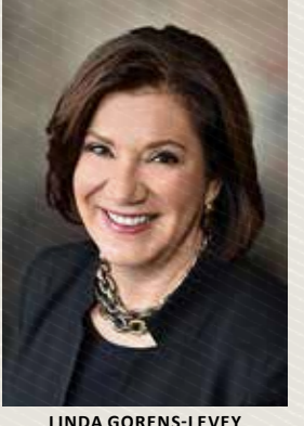
GENERAL CAPITAL GROUP