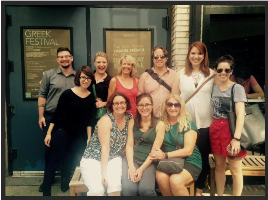
Cast and crew of Lucky Numbers at Classic Stage Company