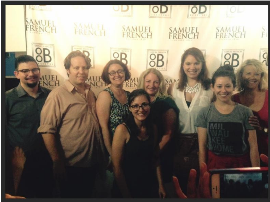
The cast, playwright and sound designer of Lucky Numbers

The cast included a group of wonderful actors: