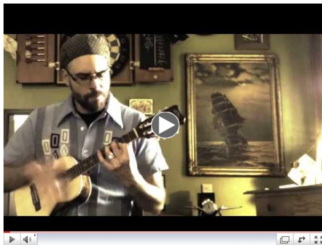
Where The Streets Have No Name - U2